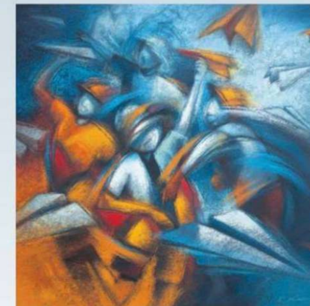
Title: Fly Your Dream Medium: Oil on canvas Size: 152.5cm x 152.5cm Year: 2017