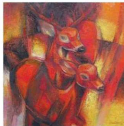
Title: Deers Searching Foods Medium: Oil on canvas Size: 61cm x 61cm Year: 2016