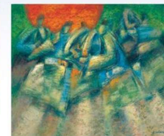
Title: Drum & Drummer 14 Medium: Oil on canvas Size: 152.5cm x 127cm Year: 2009

surface, and depth. I drew figures in their finery and executed their movements in both gentle and strong strokes, drawing the force of the actions of drummers and warrior dancers. I try to communicate these issues of identity of a multicultural country with the understanding and respectful harmony of races and cultures."