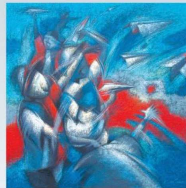
Title: Fly To "Success" Medium: Oil on canvas Size: 152.5cm x 152.5cm Year: 2017