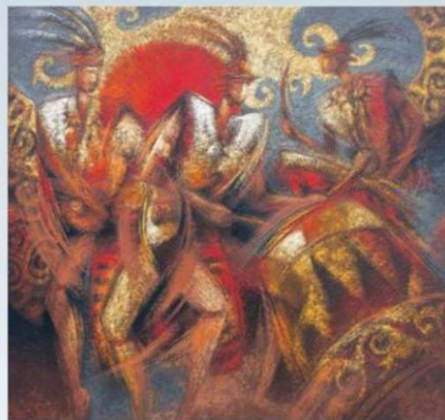
Title: Drummers & Warrior Dancer Medium: Oil on canvas Size: 152.5cm x 152.5cm Year: 2017