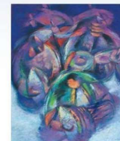
Title: Drum & Drummer 11 Medium: Oil on canvas Size: 127cm x 152.5cm Year: 2009

In his latest series, some of the works are inspired by East Malaysia's cultural elements expressing energy in the form of pulsating drums, drummers, warrior dancers, and their instruments. He explained, "I symbolize the round-shaped drum as an amalgamation of the sun and moon, the sun is harder while the moon is soft as sometimes when you bang a drum it is hard, and other times is soft. I captured the flow of sounds, waves, and even movements by my twirling stroke gesture and energetic colours which move across the surface, overlapping form of figures and subject forming unity based on the tension between the balance of colour, shape, texture,