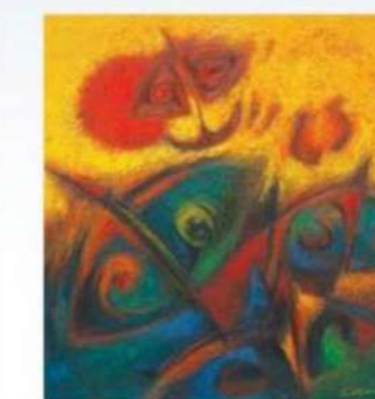
Title: "Wau" Kites Festival Medium: Oil on canvas Size: 59cm x 65cm Year: 2016